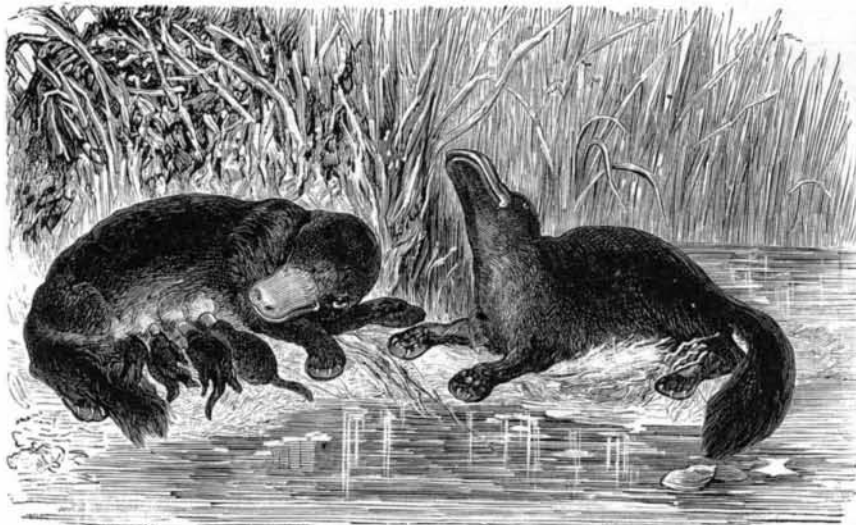
THE DUCK-BILLED PLATYPUS.

The ornithorhynchus or platypus is a singular animal, which seems to form a connecting link between the mammals and birds, and in some respects having affinities even with reptiles. It is from 18 to 22 inches long, and has a stubby tail 5 inches long. The color is brown above and whitish below. The jaws are inclosed in a horny sheath, very sensitive, like the bill of a duck, and have two horny teeth on each side; the snout is flat and broad, the lower jaw shorter and narrower, the eyes small and brilliant; ears not apparent externally, with an aperture that can be opened or shut at will; and the fur is soft and thick, like that of the otter. The legs are short, and the feet five toed, and webbed. It secretes milk for the nourishment of its young, which are born blind and naked. It burrows in the banks of streams, where it passes the day in sleep, rolled up like a ball, coming out at dusk and during the night in search of food. It is an excellent swimmer and diver, and feeds upon worms, insects, and small aquatic animals, in the manner of a duck. It walks very well, and climbs trees with facility. It can remain under water for eight minutes at a time; it is cleanly in habit, and fond of warmth and dryness. The young die very soon in confinement.