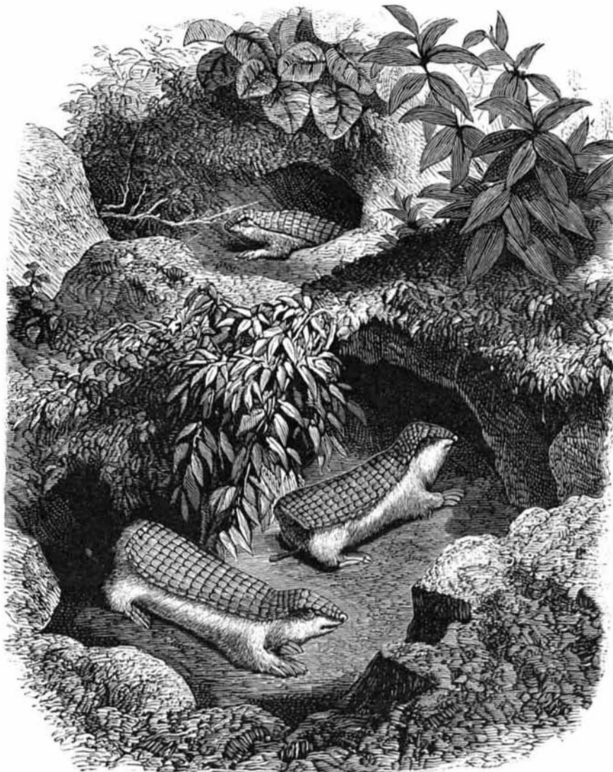
THE TRUNCATED PICHICIAGO.

Pollution of streams by manufacturers' refuse has been assigned as the cause of more evils than can be fairly brought home to it. A new charge has been brought against it, not only of serious pecuniary waste, but also of great and increasing danger to life and property. It appears that the galvanizers of the Wolverhampton district, England, are in the habit of discharging their waste acid into the sewers. The damage caused by this practice is almost incredible; but it is clearly proved that the sewers themselves are being rapidly destroyed; the irrigation farms which dispose of the sewage are being rendered unproductive; and, most serious of all, the boilers of the surrounding factories, which are fed from the neighboring canals, are rapidly corroded.— Ironmonger.