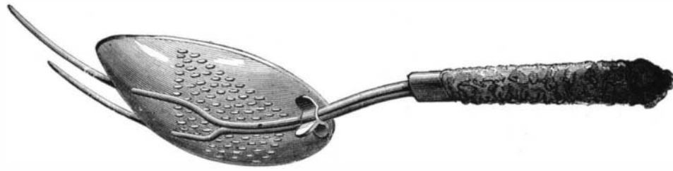
FLAGG'S COMBINED SKIMMER AND FORK.