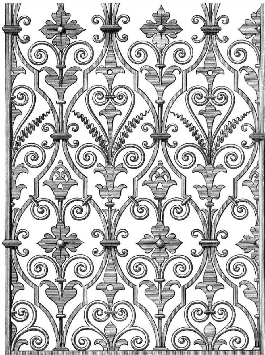
WINDOW GRILL AT RATISBON, BAVARIA.

A new utilization of sea weed is suggested in the manufacture of a fabric named as above. Sheets of carded wadding are placed on hot polished metal plates, and coated with a concentrated decoction of sea weed, lichen, pearl moss,