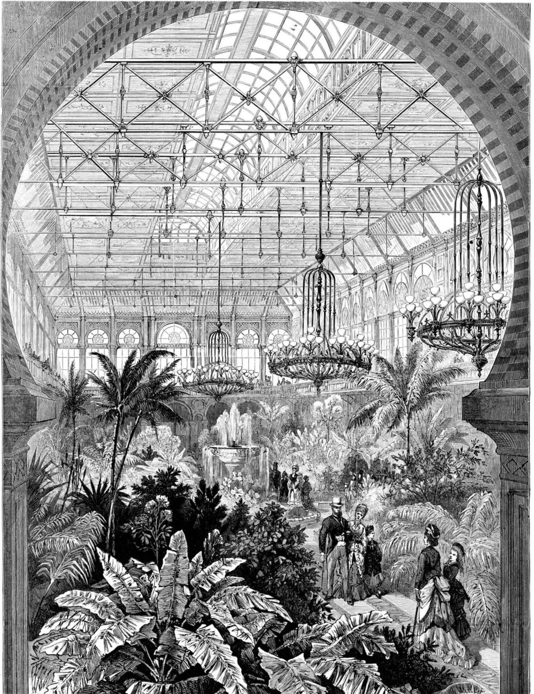
THE HORTICULTURAL HALL, CENTENNIAL EXPOSITION, PHILADELPHIA.—(See page 404.)