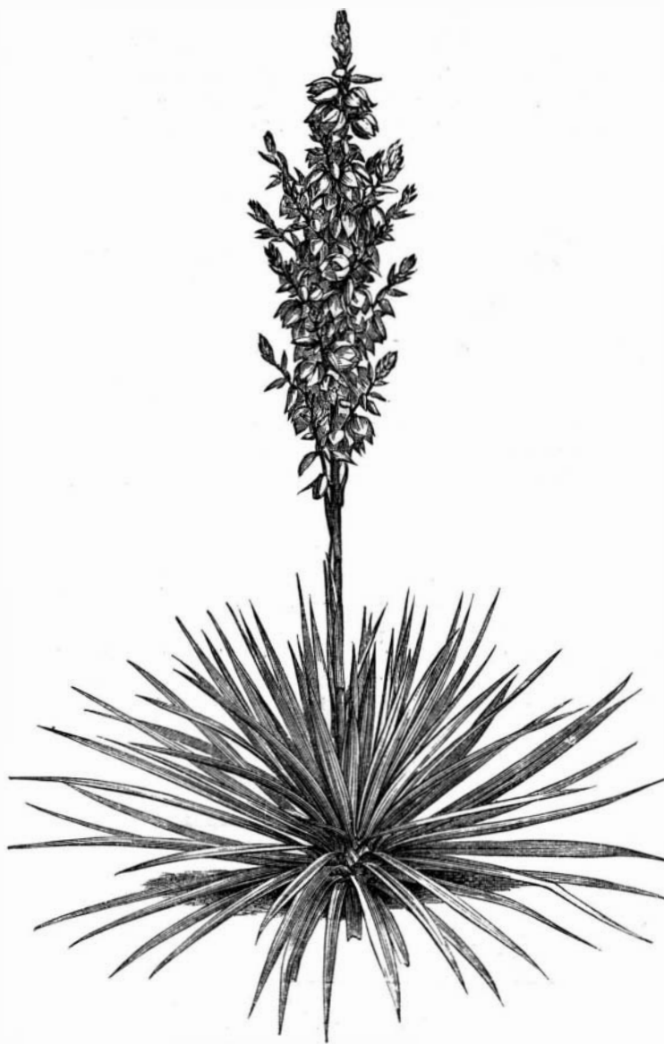
THE YUCCA STRICTA.