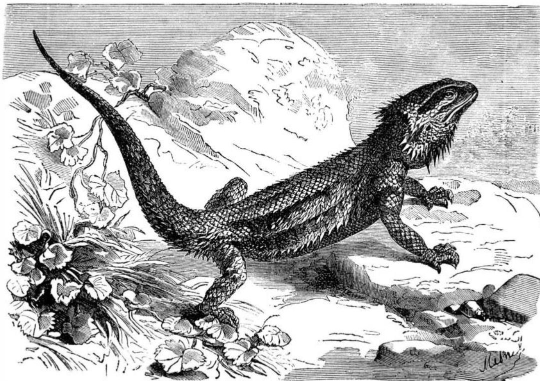
AN AUSTRALIAN IGUANA.