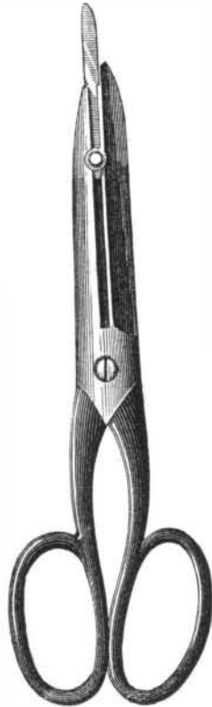
The annexed engraving shows the device very clearly.

Combination implements are coming more and more into use. Every day brings us new forms of instruments, more or less complicated, designed to reduce the number of tools which an operative must have at hand by placing several tools in one handle. Many of these devices show considerable invention, and save expense in first cost, as well as time and trouble in manipulation.