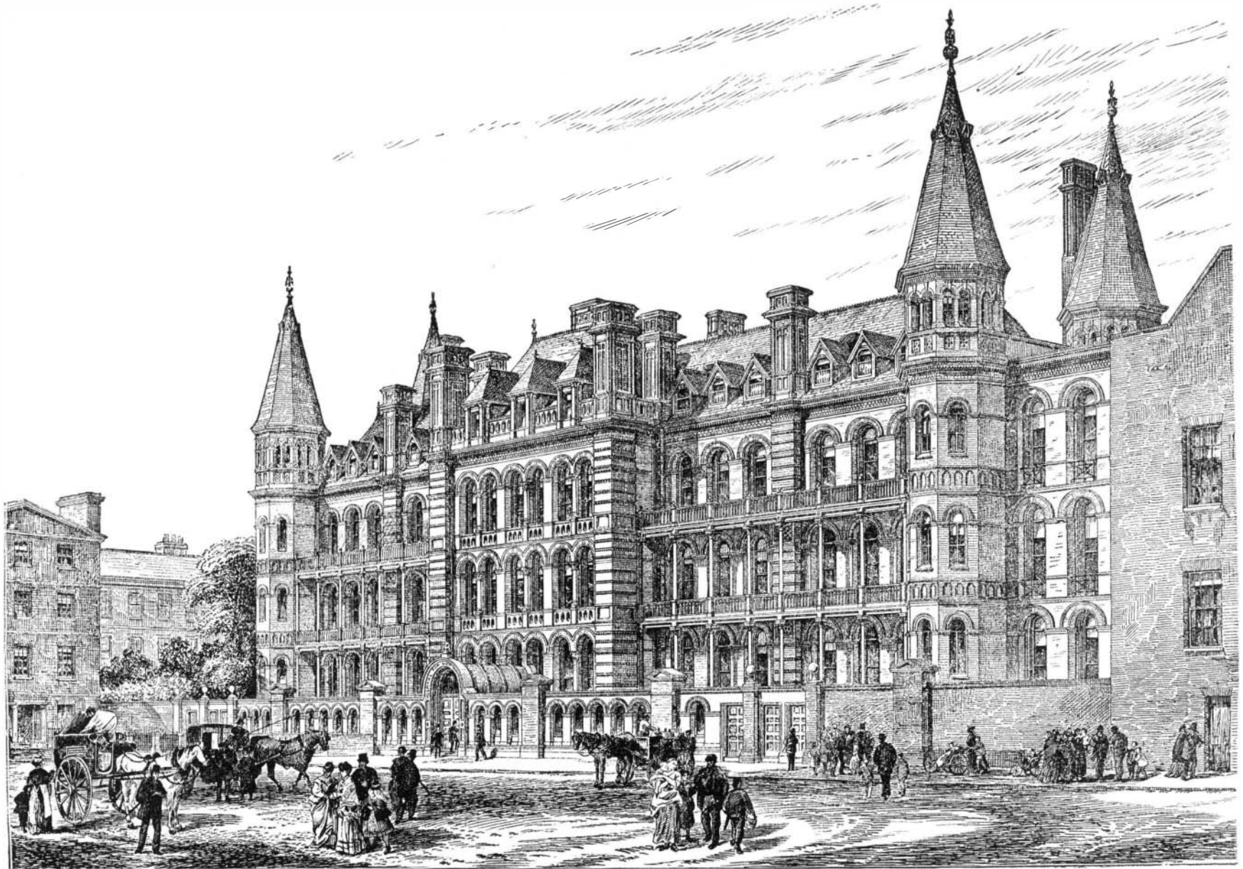
HOSPITAL FOR SICK CHILDREN, GREAT ORMOND STREET, LONDON