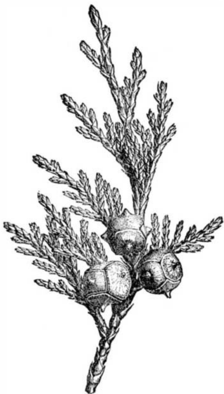
CONES AND LEAVES OF CUPRESSUS NUTKAENSIS.

The northwestern shores of this continent, especially in