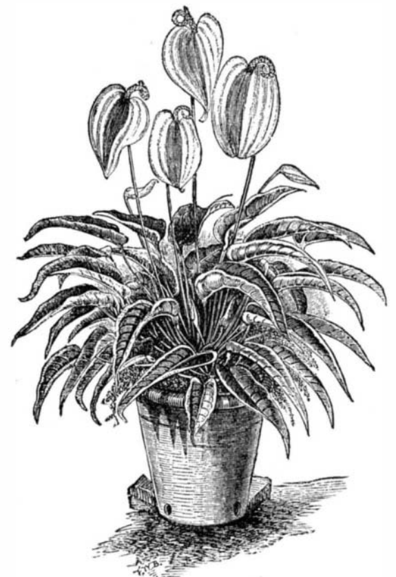
THE FLAMINGO PLANT.

At a recent exhibition of the Royal Botanic Society, a vigorous specimen of the flamingo plant, anthurium scherzerianum , bearing four remarkable large spathes, was exhibited. Our illustration, sketched at the time when it was exhibited, will give our readers some idea of the appearance of this large-spathed variety, which, for healthy luxuriance, we have never seen exceeded. The broad flat spathes were fully 5 inches in length and 4½ inches in breadth, and attracted much attention. In color these spathes were not so brilliant as those