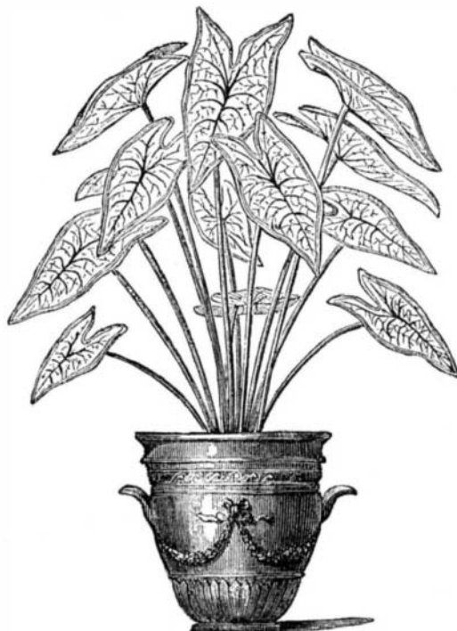
CALADIUM BELLEYMEI AS A VASE PLANT.

The caladium is undoubtedly one of the most ornamental and attractive of our fine foliaged stove plants, and few con-