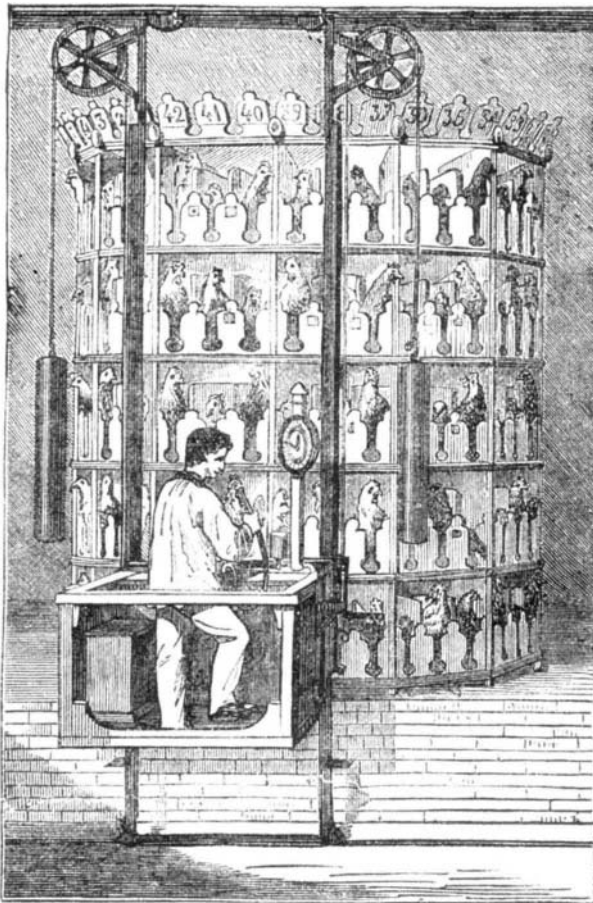
FATTENING CHICKENS BY MACHINERY.

The various shades of the spots lead to the determination of some curious and important facts regarding the satellites. The second satellite was evidently more luminous than the third, since it remained invisible on the white zone; while the third was even darker than the gray belt over which it traveled. The latter in fact was hardly brighter than the