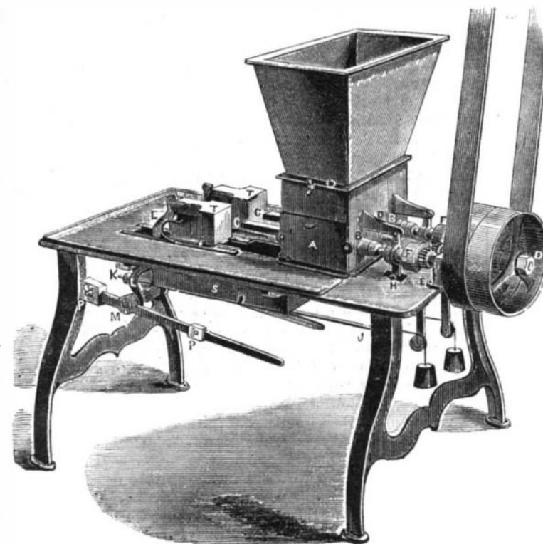
AUTOMATIC PACKING AND WEIGHING MACHINE.

In operation, the attendant places an empty package on form, C. The follower blocks, T, are moved up against the bottom of the package, which brings the frictional pulleys, F, in contact, thus starting the screws, B, which force the material into the package on the form, C, causing the follower block T, and lever, L, to recede. The latter is brought in contact