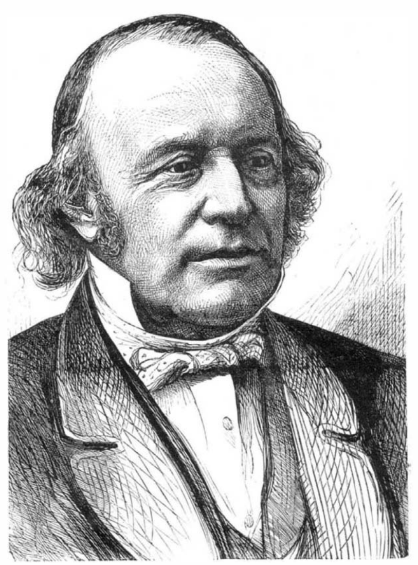
THE LATE PROFESSOR AGASSIZ.—(See page 2.)

some eighty miles in a total of 318 miles, or a saving of some thirty per cent. The structure will be of the truss shape, and the railroad tracks will be on the upper or top chord, at an elevation of 194 feet above the river. By the terms of the charter, the company are empowered to erect four piers in The other half will consist of land approaches, mainly on the and finally Chief Justice, Judge Nelson, perhaps more than