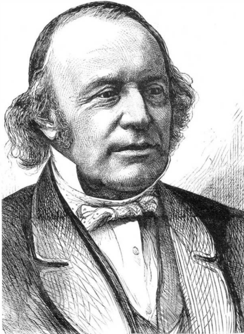
THE LATE PROFESSOR AGASSIZ.—(See page 2.)

BINDING.—Subscribers wishing their volumes of the SCIENTIFIC AMERICAN bound can have them neatly done at this office.—Price $1.50.