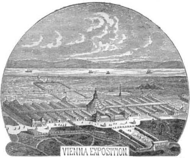
THE GREAT EXPOSITION—LETTER FROM UNITED STATES COMMISSIONER PROFESSOR R. H. THURSTON.