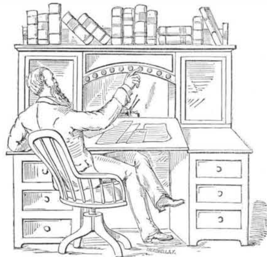
THE MINIATURE TELEGRAPH. FIG. 2.

As used in our office, these instruments are placed upon the desks in the various departments of our establishment, and from them wires extend to the desks of the managers, on which buttons are fixed, which connect with the wires. When the manager wishes to communicate with any particular person on the premises, he touches the button corresponding to the wire leading to the bell where the individual is at work. The touch sounds the bell, and, as a variety of signals may be sent, one bell may serve to signalize different persons who are within its hearing. It is surprising how many steps the use of this little contrivance saves, and how greatly it facilitates the transaction of our office business. Previous to its introduction, it was necessary for us to employ messengers, who did little else than run from one part of the premises to another, consuming time and making mistakes. This miniature telegraph saves all such