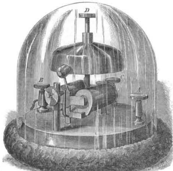
THE MINIATURE TELEGRAPH FIG. 1.