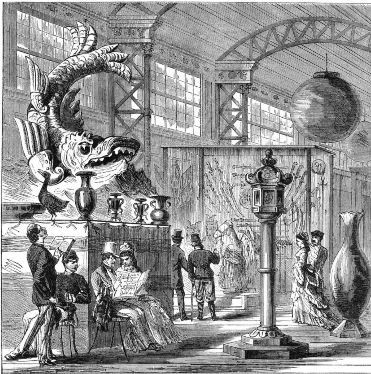
THE JAPANESE DEPARTMENT, AT THE VIENNA SHOW.

We note that the government is about to test, by samples