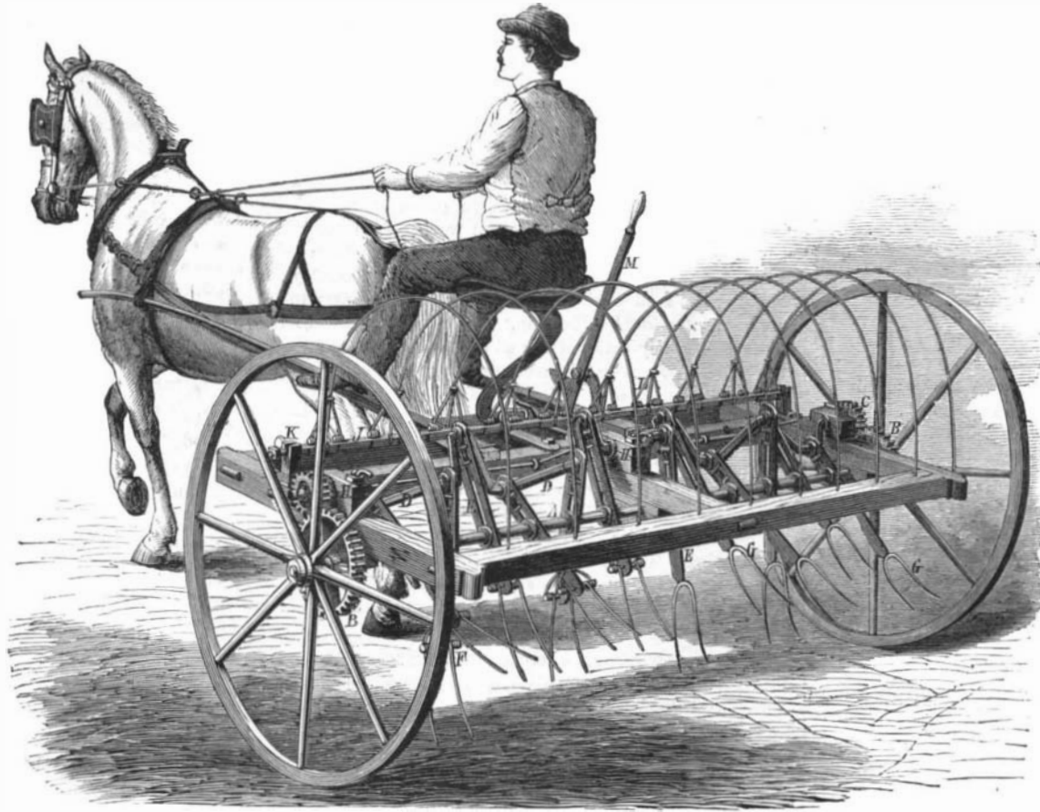
COLVIN'S COMBINED HAY RAKE AND TEDDER.

Further particulars may be obtained by addressing the