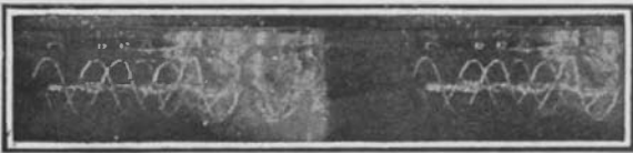
VELOCITY OF PROPELLER, 2 METERS PER SECOND.

Flamm finds that the most obvious features of a ship's screw were entirely overlooked by its originators, yet these very features indicate the real reasons for a propeller's action. One of these was the seething mass of water immediately behind a steamer's stern, and another, that familiar condition of any cast-off propeller, that when they have lost their usefulness they have a peculiar shape. The edges of the blades are always rough and irregular through erosion. Why are only the ends in that condition while the hub remains unimpaired? Prof. Flamm's experiments not only explain this paradox but also dispose of two very common notions; that a screw at the highest speed of its revolution, loses propelling effect through "cavitation" (a vacuum formed in the water behind the blades) and that the propelling effect may be increased