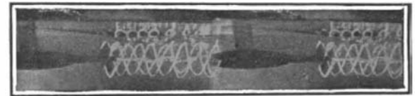
VELOCITY OF PROPELLER, 3.7 METERS PER SECOND.

Observations of a worm-shaped air-space behind the hub of the experimental screws were not productive of much surprise. This was a neutral space without suction or pressure, as indicated by introducing a small tube. Air blown through that tube considerably increased the waterless space below the surface. Nevertheless, Flamm found that true "cavitation" exists, but that, quite contrary to established notions, it marks the very climax of a screw's efficiency. As this efficiency depends to its greatest extent on suction, it becomes evident that a screw is most efficient at the moment there is enough suction to actually create a vacuum. "Cavitation" is wasteful in that from the instant it begins, any increasing of the number of revolutions per minute does not increase the propeller's efficiency at the same rate that it costs power. It