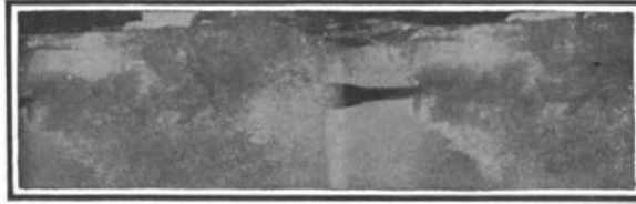
PROPELLER SUCKING IN AIR FROM SURFACE.

All the Flamm pictures show a positive dent in the water-level, immediately above the screw's periphery—the water is being sucked down to the screw's center with such force that it cannot flow in quickly enough from the sides to fill up the vortex. Flamm states that this dent exists even around a freight steamer's propeller when it is so far out of the water that the top blade projects above the surface. The water's quick turbulency on the slopes of this dent engulfs air, which is taken down to the blades; this peculiar ad-