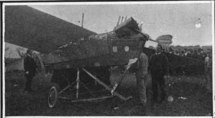
Front view of Latham's monoplane, showing damage sustained in alighting.

Holland compound is a solution of 5 parts of soda water glass and 1 part of carbonate of soda, or a powder mixture consisting of 3 parts of calcined soda and 1 part of dry potash water glass. Ten parts of this mixture is said to be sufficient to render 100,000 parts of hard water soft.