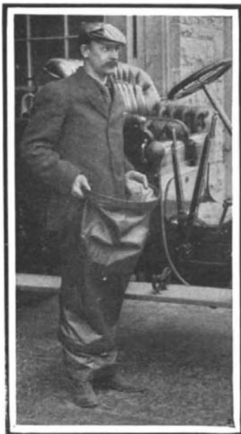
A STORM APRON FOR CHAUFFEURS.

The latest addition to the equipment of a well-appointed car is the "cling tight storm apron," manufactured by the Beebe Elliott Company of Racine, Wis., and shown in the accompanying illustration. The storm apron, designed to protect the driver of the car in cold or wet weather, is made of water-proof material, with a spring steel band to encircle the waist and another band to spring about the ankles. The apron cannot slip down from the waist, and if placed over the ordinary lap-robe, holds it snugly about the person of the driver in a manner never possible before. There is perfect freedom for the feet to operate the pedals on the floor of the car. The wind and water are kept out, and the comfort of a warm robe about the body is kept in. There are no straps or buttons or buckles to cause annoyance, and the apron may be put off or on in an instant.