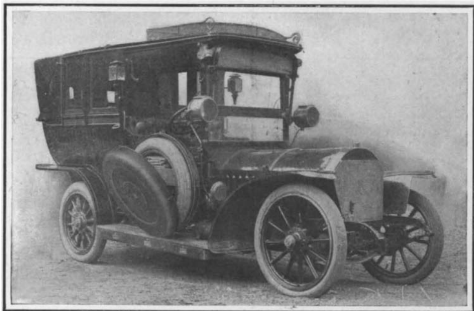
A NOVEL TIRE-CARRYING CASE.

One of our illustrations shows a new metal carrying case for automobile tires, which offers several advantages over the ordinary rubber covering that is placed over a shoe. This case is made of pressed steel, and weighs only about 25 pounds. It is hinged so that the outer half can be opened instantly, as soon as the lock has been unfastened. The spare shoe can then be quickly removed if it is needed. In the center of the case there are two spaces, the upper one being for spare tubes, and the lower one for tools. These cases are made sufficiently large to accommodate two 4½x36-inch shoes, and the fact that they provide waterproof and burglar-proof holders for the tires and tools is sufficient to warrant almost any automobile user purchasing them. Added to these advantages is that of ready and quick accessibility when the tire is needed. At the recent Automobile Show in the Grand Central Palace, one of these cases made of spun copper was exhibited. Although it had been in use on a car for nearly 3,000 miles, there was practically no indication of this from its appearance. When made of pressed steel, these cases will be even more durable.