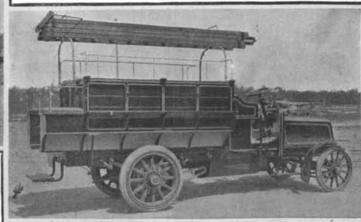
Fig. 2.—The trolley-repairing truck ready to start.

Each drop, as it falls on the dish, unites with the solid mass formed by preceding drops, and thus the ruby increases in size and assumes the form of a pear resting on its stem.