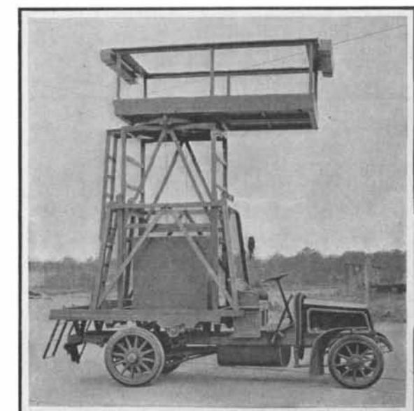
Fig. 1.—Electrically operated trolley-repairing automobile in service.

hydrogen blowpipe, producing a temperature of 3,300 deg. F. Minute ruby chips were then brought, one by one, with pincers, into contact with the incandescent nucleus, and the process was continued until the mass had attained the desired size. The chips became welded together and formed a mass sufficiently compact and homogeneous to allow of cutting. The work required great skill and the partially amalgamated crystals often cracked in cooling. At first the reconstituted rubies, uncut, sold for $2.40 per carat. About a thousand carats daily were manufactured in Paris and exported to Germany and America, and even to India, whence they sometimes returned, mixed with natural rubies. Competition gradually lowered the price to 6 cents per carat.