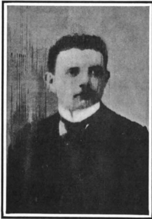
Fig. 1.—A portrait transmitted from Lyons to Paris in 5 1/2 minutes by the new Belin telestereograph.

photographs, in which the receiving cylinder rotates. This cylinder, corresponding in dimension with the transmitting cylinder, carries the photographic film or paper upon which the transmitted picture is impressed.