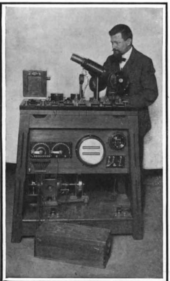
Fig. 2.—The new Belin telestereograph.